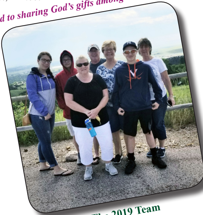
The 2019 Team

“Committed to sharing God’s gifts among all peoples of the world”